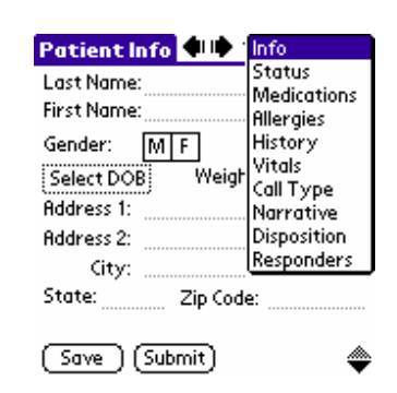
Figure 8: An Input Form

While the EMS Portable Workflow System is operational, its design and implementation, along with the resources Palm OS 5 provides to its users, leaves many options for future work topics. The project was able to achieve mostly automatic reporting features. Future work falls into two categories. First, future work to improve the current reporting system and