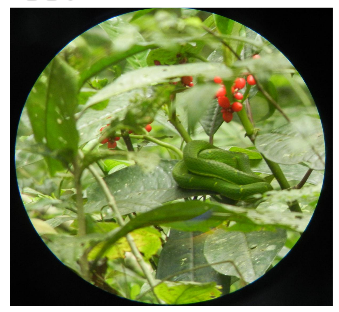
The Year of the Snake