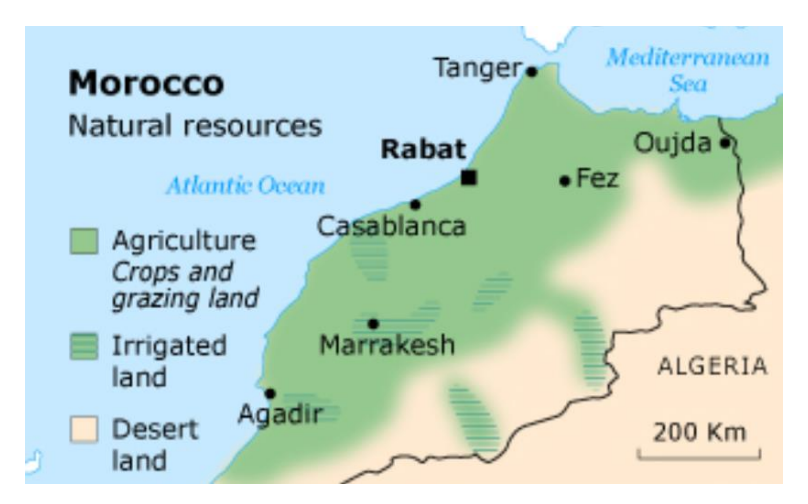
Figure 4: Geographical distribution of agricultural, irrigated, and desert land (Fanack, 2017).

It is a challenge to accurately estimate the number of organic farms currently in Morocco. Many farmers run their farms with organic practices- they rotate their crops, use manure for fertilizer, and avoid pesticides or insecticides. Most of these farmers are not going organic by choice; they do not have the resources to afford supplies such as insecticides, pesticides, herbicides, and fertilizers. Without even knowing it, Moroccan farmers are protecting their population from the harmful effects of these chemicals. According to the World Health Organization, three million people worldwide experience pesticide poisoning each year (Lah, 2011). While farmers that do not use pesticides are technically organic, the certification to become an organic farm is still a tedious process for small-scale Moroccan farmers and expensive depending on the level of certification.