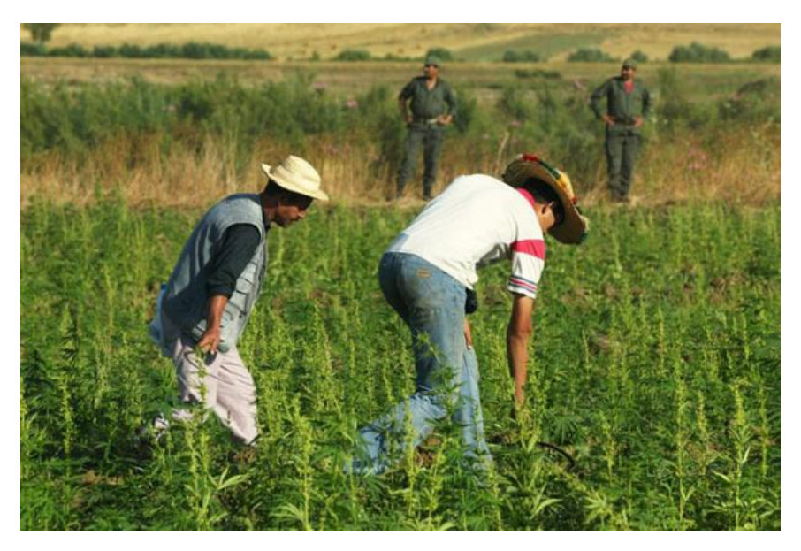
Figure 3: Small farmers in Morocco ("Moroccan Parliament", 2014)

Farmers waste a large portion of their profit buying fertilizers, chemical treatments, and pesticides for crops that often barely bring sufficient revenue to cover their expenses (Benaziz, 2014). These harsh chemicals are a severe detriment to soil quality and increase environmental contamination (Bendra et al., 2012). The introduction of more information on organic farming can potentially help small scale farmers save money and naturally put crucial nutrients back into the soil.