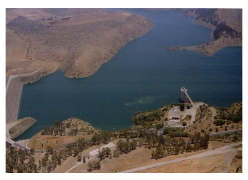
Figure 2: Sidi Muhammed-Ben-Abdallah Barrage Dam (Directorate Atlantic Coast, 2004)

An agricultural extension center (AEC) is a service that provides guidance and resources to farmers and other agricultural producers. These resources can be in the form of training sessions, workshops, outreach programs, model farms, or other similar programs. Centers can be controlled by universities or research institutions but are sometimes completely independent entities. A proposed new agricultural extension center will be located near the Sidi Muhammad-Ben-Abdallah Dam, shown in Figure 2, approximately 10 km outside of Rabat. The location will provide an ideal site for any agricultural irrigation testing and model farm plots at the proposed AEC.