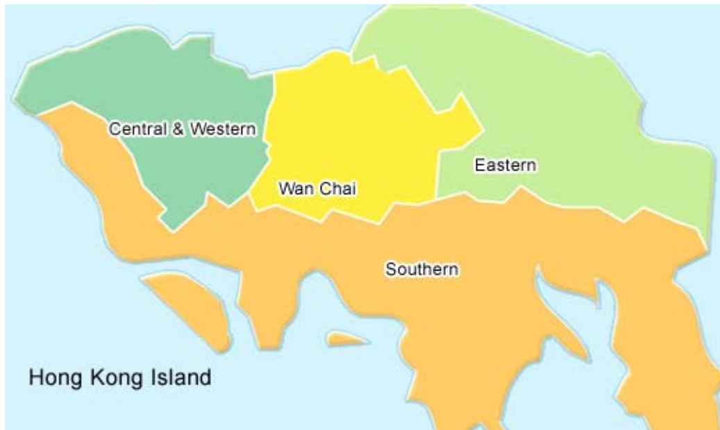
Figure 2.5-1: Districts of Hong Kong Island (Home Affairs Department, 2010)

There are four districts of Hong Kong Island: Central and Western, Eastern, Wan Chai and Southern (Home Affairs Department, 2010). Central and Western, Eastern, and Wan Chai, will be the main focus of this report. Figure 2 highlights the boundaries of each district.