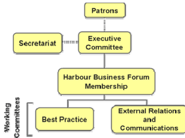
Figure 0-1A: Structure of HBF (Harbour Business Forum, 2010, About Us)

Under the patrons is the Executive Committee (Harbour Business Forum, 2010, About Us). The Executive Committee is comprised of the Senior Representatives and a chairperson from each working committee. Also a part of the Executive Committee is the Secretariat, who ensures good communication throughout all parts of the organization. The two working committees are the Best Practice Committee and External Relations and Communication Committee. See Figure A-1 below for a visual representation of the structure of the HBF. Overall, the HBF has 121 members that range from corporate members to supporting members. Some of their affiliates are Harbour-front Enhancement Committee, Harbourfront Commission, Designing Hong Kong, Friends of the Harbour and many other government departments and organizations.