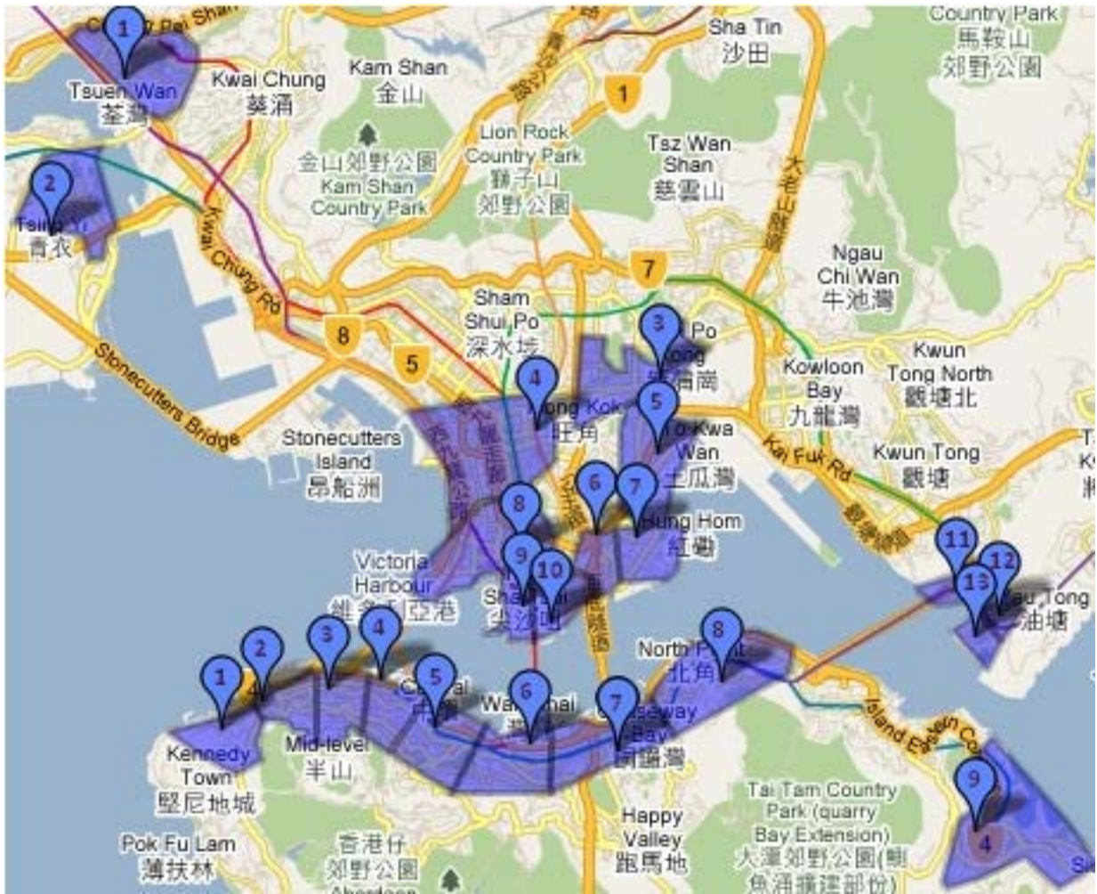
Figure 3.3-1: 22 Action Areas in Google Maps