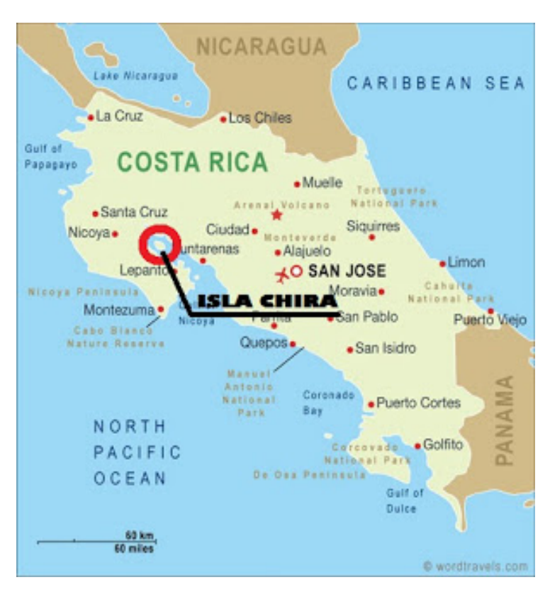
Figure 5: A map of Costa Rica, highlighting Chira Island's location in the Gulf of Nicoya ("LatiNOTES: Chira Island, 2011)

To understand the context of our study, it is worth noting that Chira Island has been largely untouched by the globalizing forces of mainland Costa Rica and its location in the Gulf of Nicoya has culturally isolated it from the rest of the country. This isolation, combined with its small population of 1,576 people, has caused Chira Island to become a relatively remote location (González and Cole, 2012). Additionally, much of the island still remains undeveloped. The buildings are predominantly houses, along with a few restaurants, stores, and mechanic shops. The island is also technologically behind the rest of Costa Rica— the main road is unpaved, bicycles are the main source of transportation, and the island only received internet services in the past few years (González and Cole, 2012). In the map of Figure 6, one can see the central road of the island as well as the communities of Palito and Montero, where we will be conducting our field work.