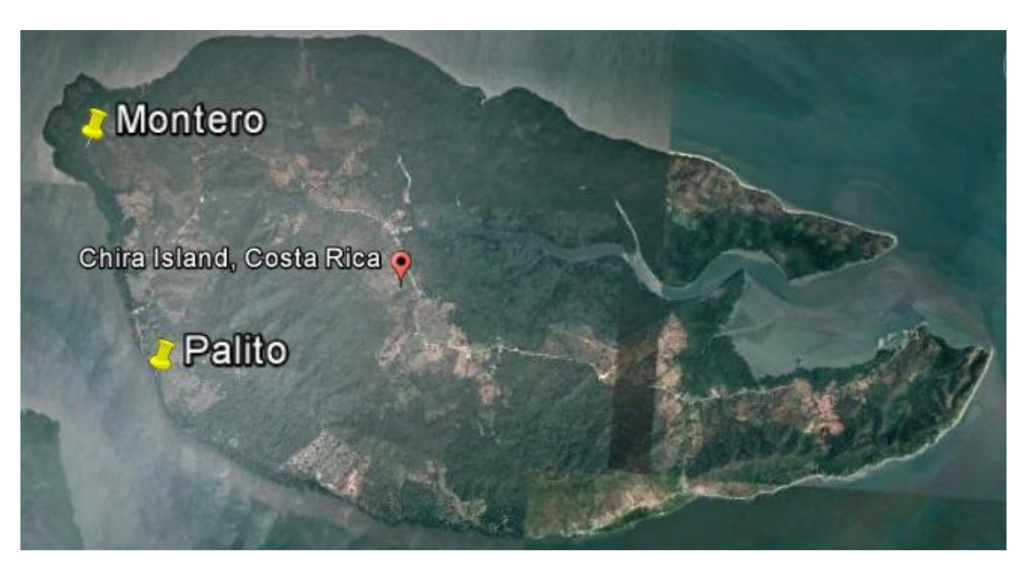
Figure 6: A Google Earth Image of Chira Island.