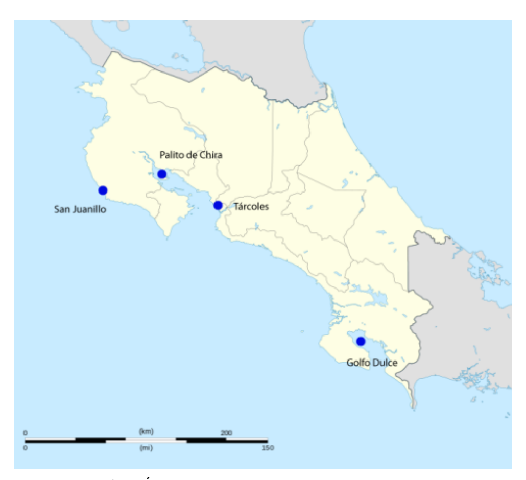
Figure 2: The locations of the Áreas Marinas de Pesca Responsable currently in place in Costa Rica.