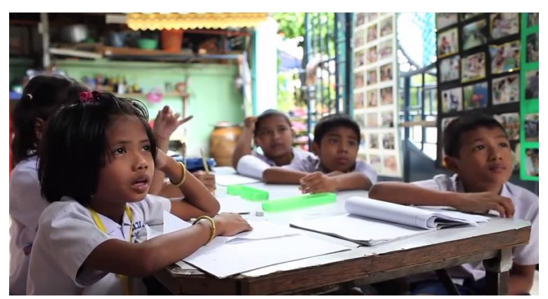
Figure 3 - Children learning at a Raks Thai learning center in Mahachai

sustainable solutions for the problems faced by the underprivileged communities of Thailand. They currently focus on providing health and educational services to underprivileged citizens as well as promoting community development and environmental sustainability. In accordance with these goals, they have set up learning centers, such as the one shown in Figure 3, throughout Thailand in an effort to provide for the educational needs of the children there.