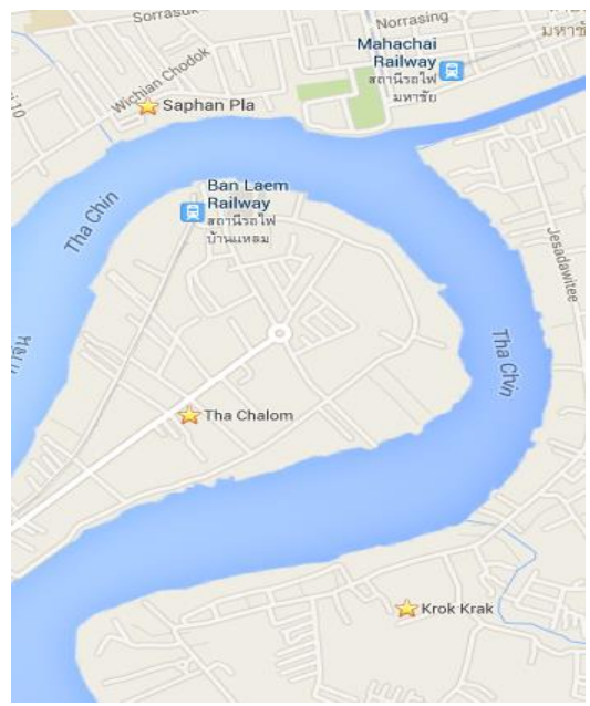
Figure 4 - Locations of Raks Thai learning centers

They currently operate four learning centers in Mahachai which will serve as the focus of our project. For the past ten years, these learning centers have served 140-150 children ages 5-15. Two small centers, located near Saphan Pla, serve approximately 20 students. The larger centers are located in Tha Chalom and Krok Krak. Figure 3 shows the locations of the centers. Each center divides its students into two groups. The first group, the primary class, is for young students, and students who do not know Thai. The second group contains the older and more advanced students.