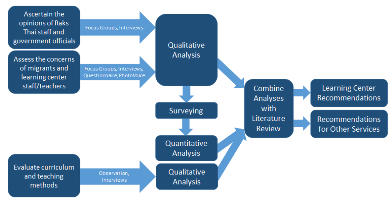
Figure 5 - Methodology flowchart

When trying to interpret a problem in its full complexity and capture the human experience, using only methods that count and measure will not provide the same meaning as qualitative research strategies. Thus, the action research method suggests collecting preliminary qualitative data to determine the issues of most concern and assess the situation (Berg & Lune, 2012). This is particularly essential for our project because it is social in nature. The only way to determine the success of a school is by interacting with people to investigate relationships and activities within the institution (Dilshad & Latif, 2013).