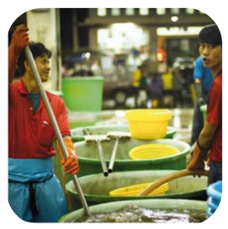
Figure 2 - Migrant workers in a seafood processing facility in Mahachai

[Untitled photograph of workers preparing shrimp for sale at Mahachai market].