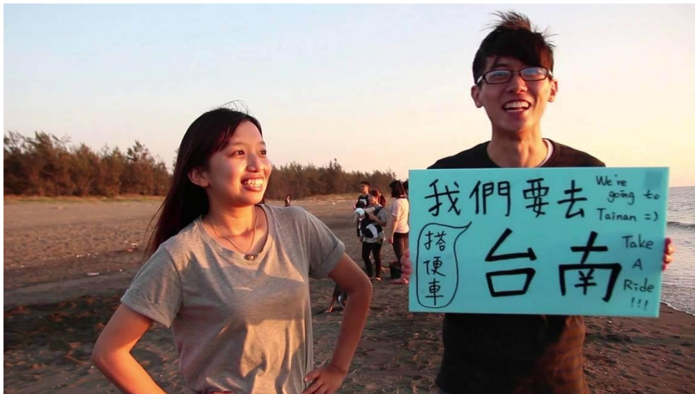
Figure 2.5 - Two Wandering Challenge participants taking a day trip to Tainan, Taiwan by hitching rides from friendly strangers as part of a Mission, titled Zero Dollar Challenge.