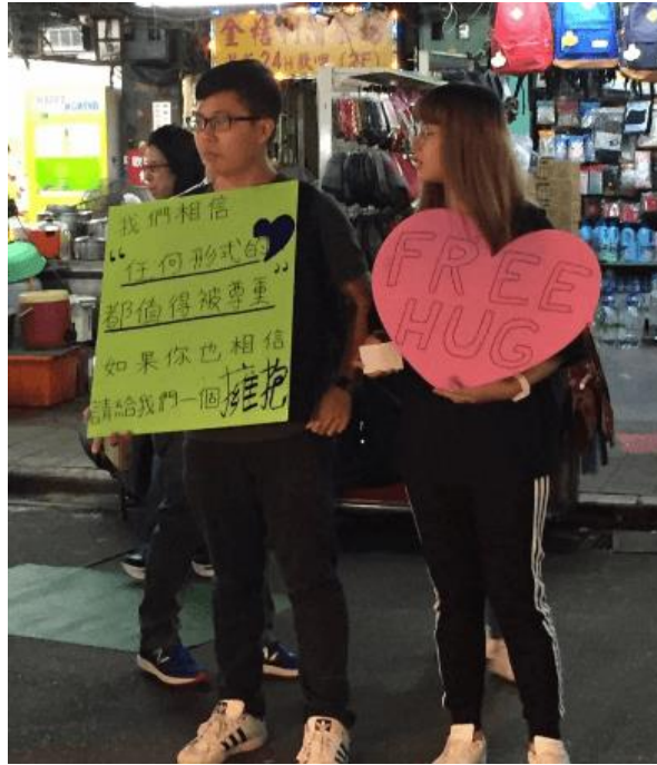
Figure 2.4 - Two Wandering Challenge participants giving out hugs to strangers in the street as part of a Mission, titled Free Hug, Free Care.